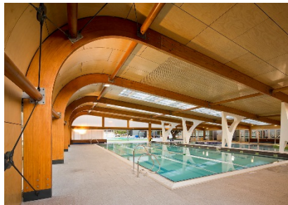
Open Knee Glulam Portal Frames