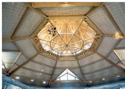
50m Span Octagonal Pool