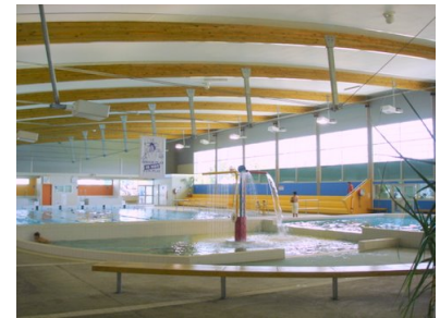
38m Span Glulam Trusses