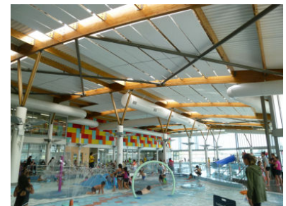
30m Long Curved Glulam