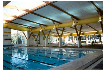
"Y" Frames & Glulam Rafters