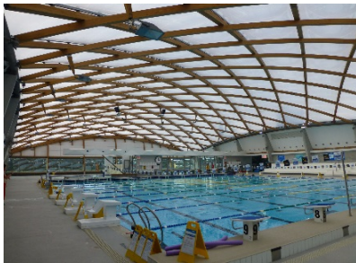
40m Glulam Grid shell

The corrosive resistance of Glulam, its strong lightweight capabilities and the natural attraction of timber, make this an ideal construction material for swimming pool enclosures.