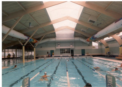
27m Span Curved Portals